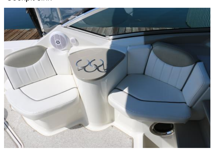
Seating to port of helm station