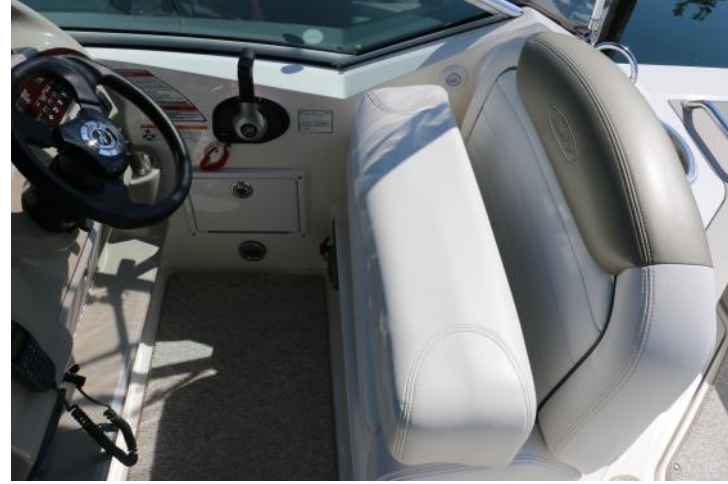
Helm seating with bolster