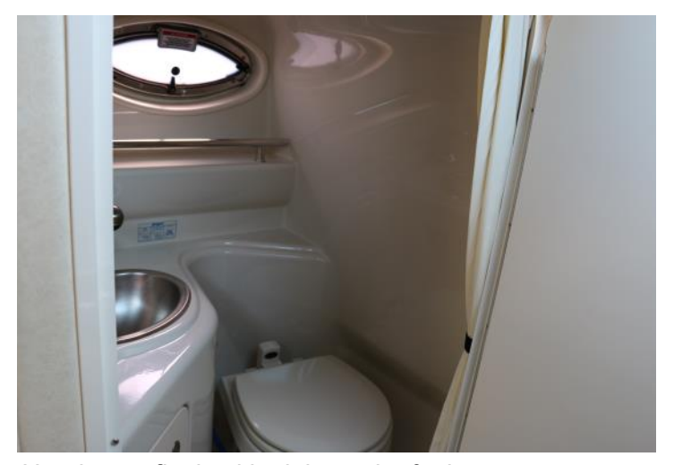
Head, vacuflush with sink, vanity & shower