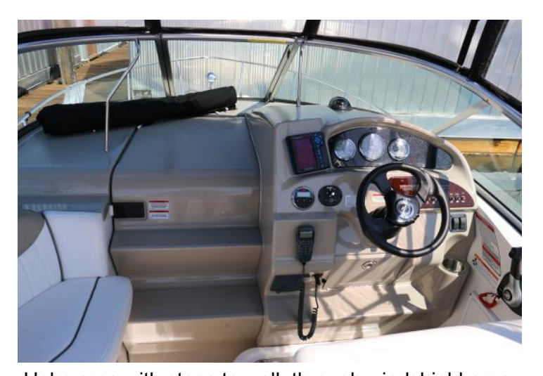
Helm area with steps to walk through windshield area