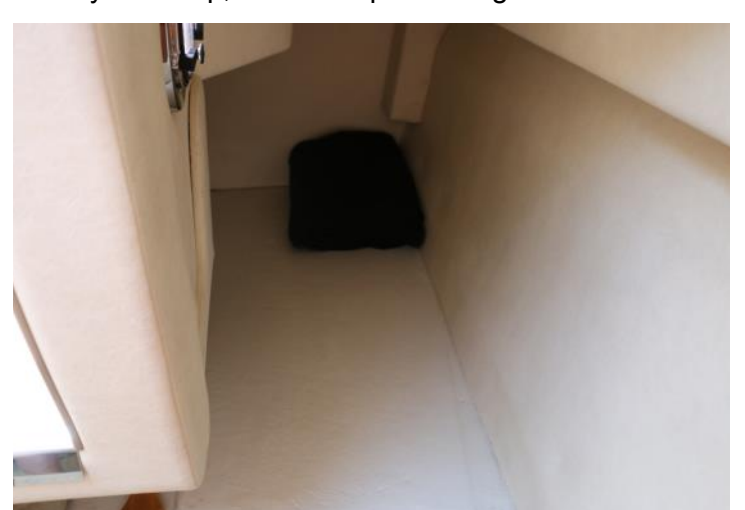
Mid Berth Cabin (double bed)