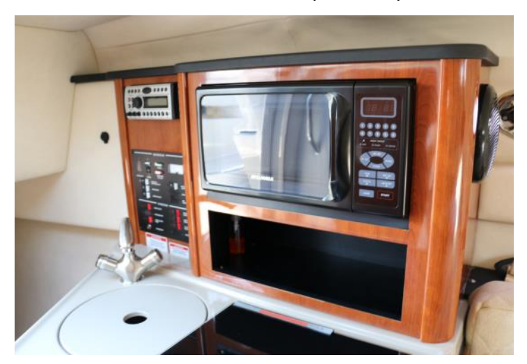
Microwave and counter area at galley