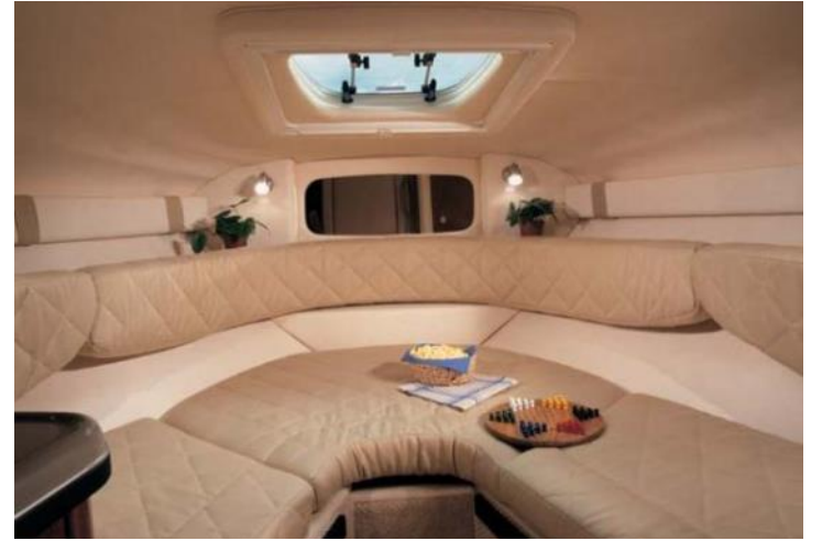
Fwd v-berth area, manufacturer provided photo