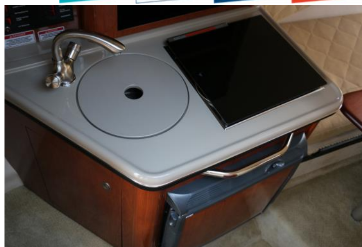
Galley cook top, counter top with single sink