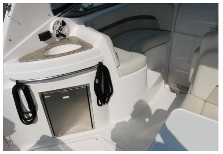
Cockpit sink and refrigerator