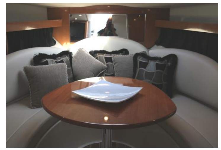
V-berth area fwd