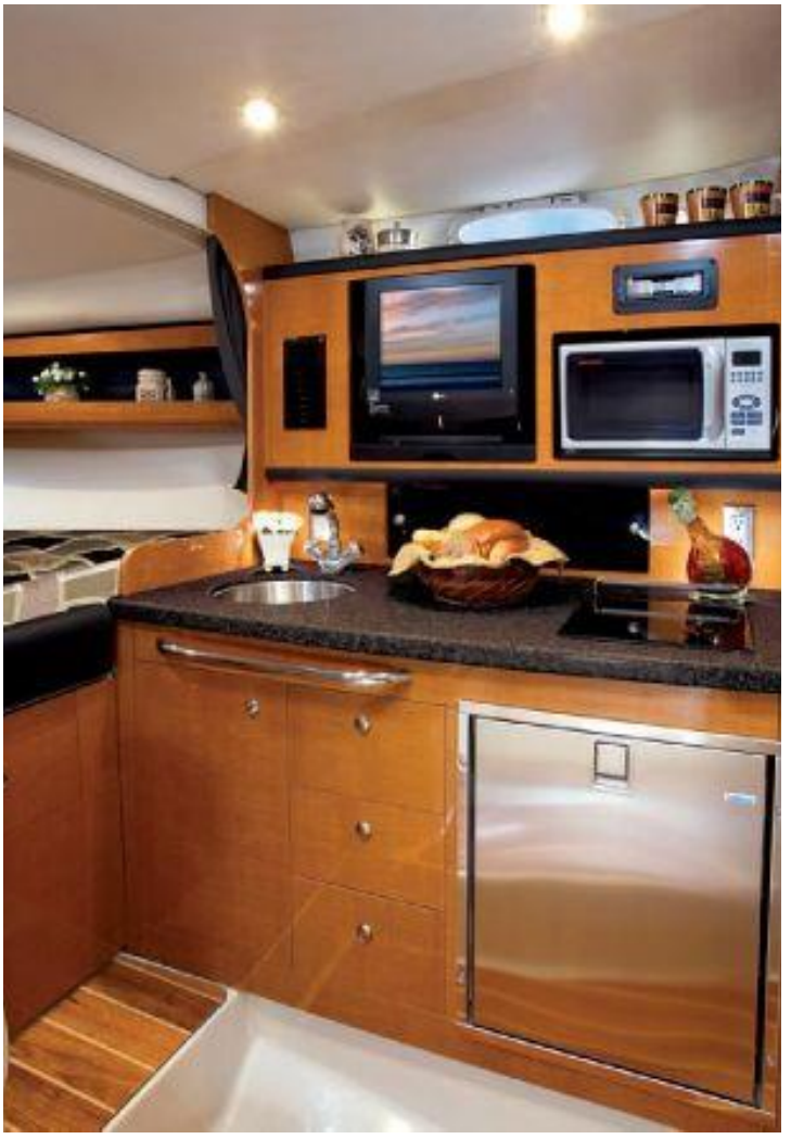
Professionally appointed galley area