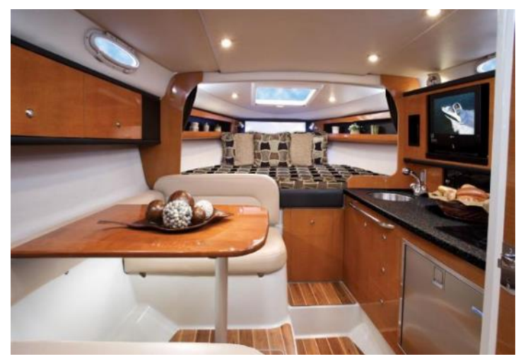
View fwd through to v-berth area