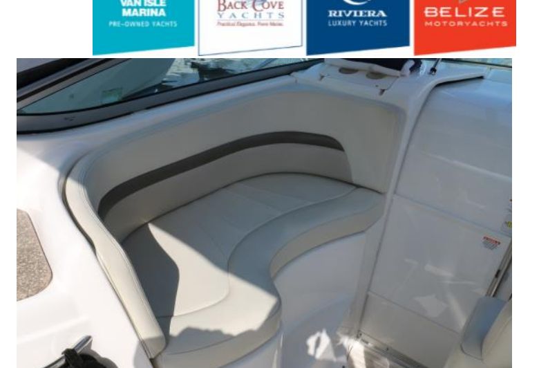
Guest seating to port of helm seating