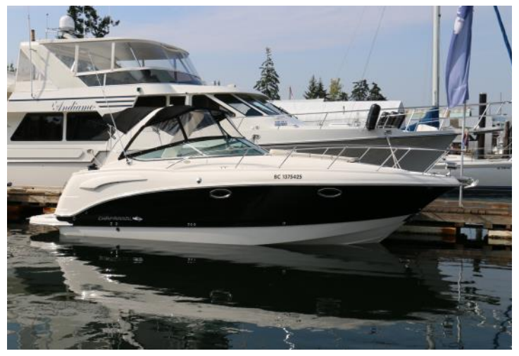
In water starboard view