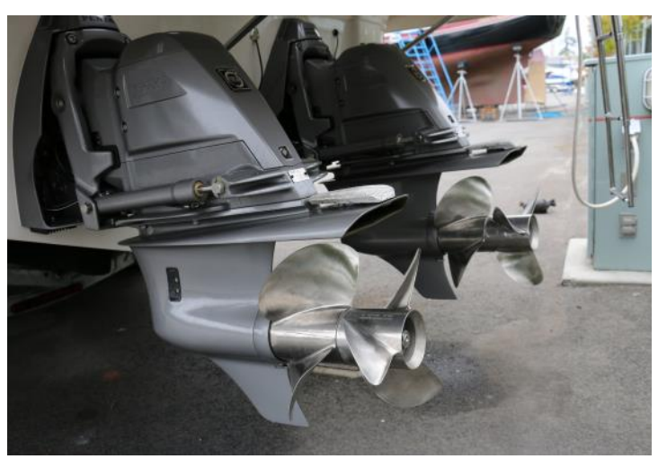
New stern drives July/Augsut 2014