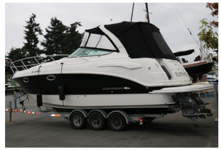
On trailer port aft