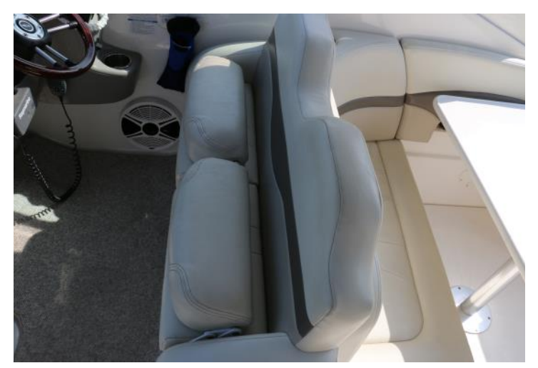
Bolster seating if required at helm