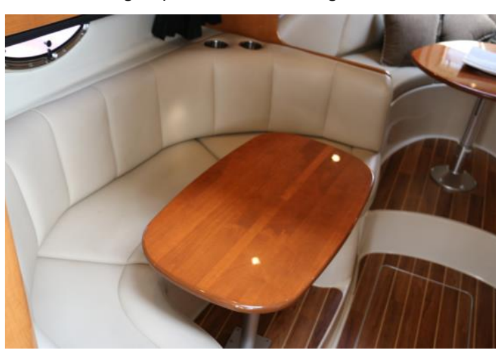
Dinette on entry to cabin