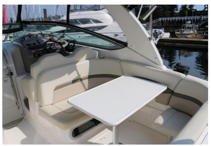
Cockpit seating aft of helm