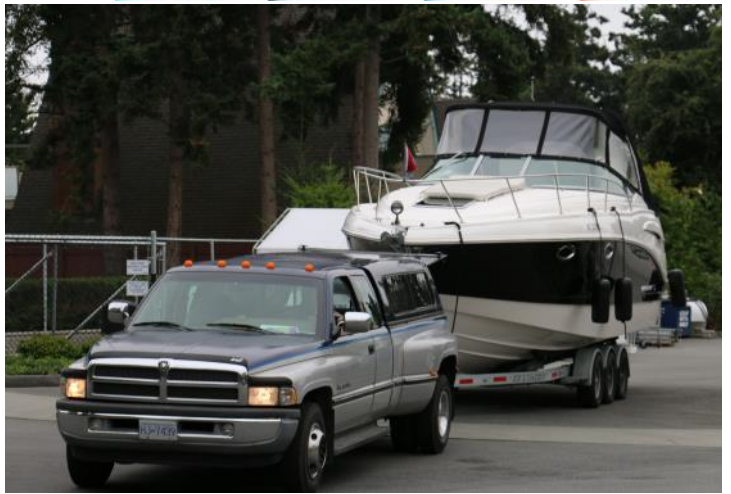
Truck & trailer & Chaparral