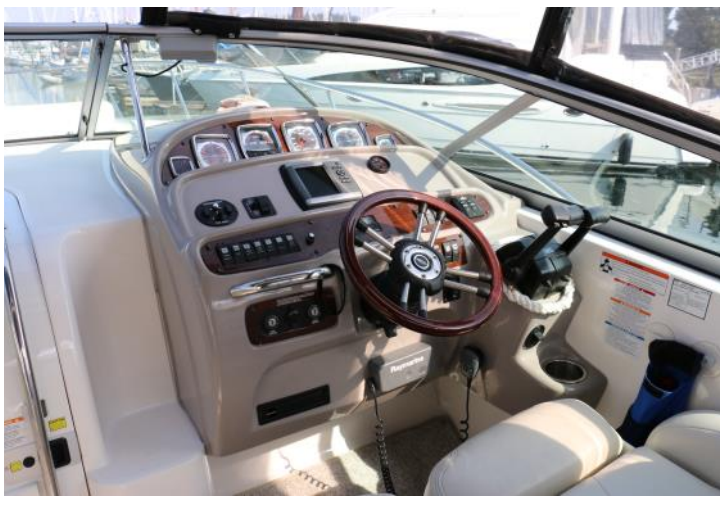
Helm position fwd starboard