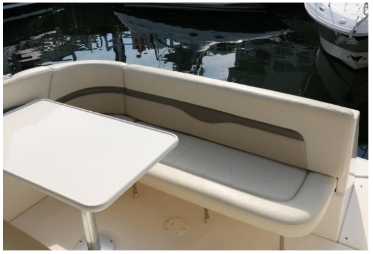
Aft cockpit seating