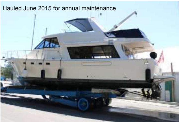
Hauled June 2015 for annual maintenance